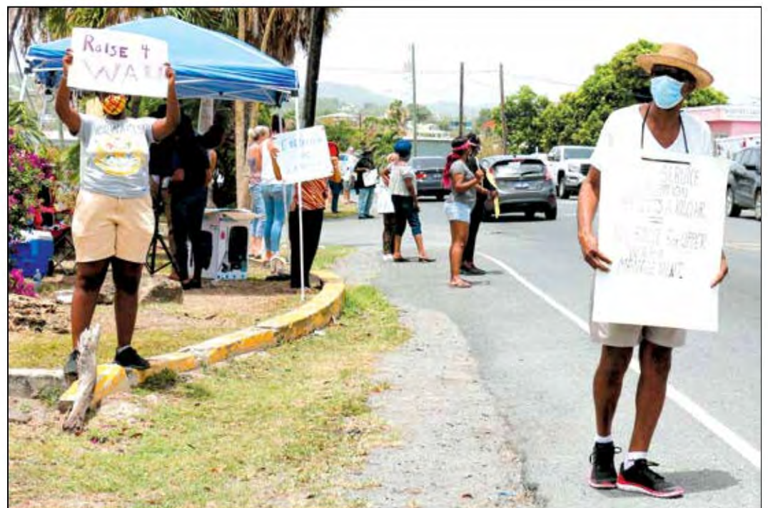
Placard-toting residents encourage passing motorists to honk in support.

Two protesters set up shop outside the WAPA office in the Sunny Isle Annex, which wasn't open Saturday.