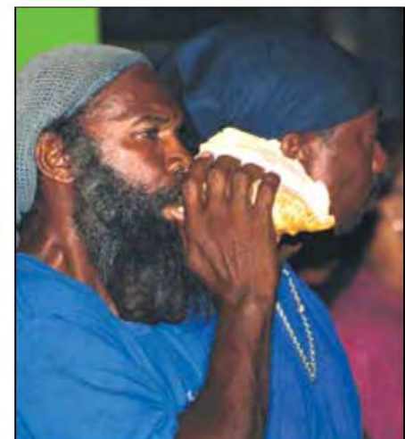
This St. John resident blows the ceremonial conch shell during the 2014 Village.