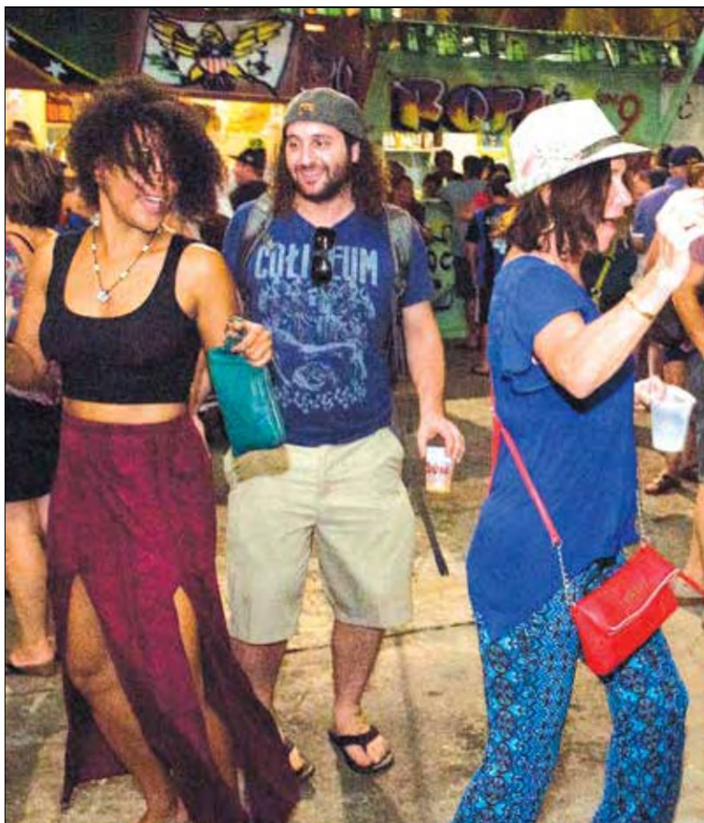
This duo can't resist the beat of soca during the 2015 Village.