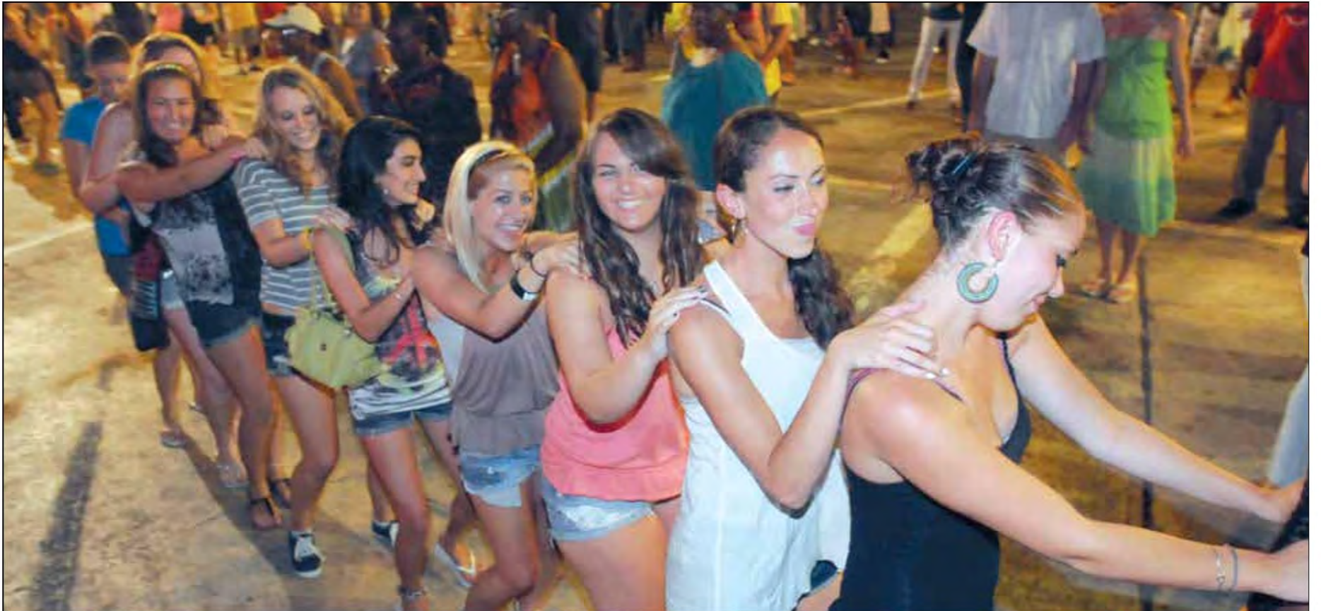
Revelers form a conga line during the opening night of the St. John Festival Village in Cruz Bay in 2011.