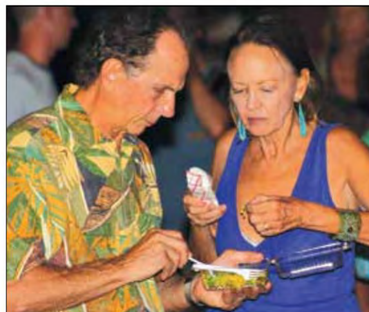
Village-goers sample food in 2014.