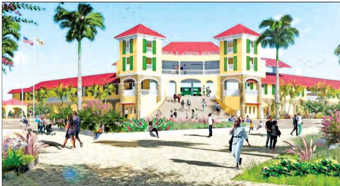
An artist's rendering of the multimillion-dollar Paul E. Joseph Stadium project.

The amended appropriation bill would require the Public Works Department to submit updated photos of the project to the Legislature, plus a budget report that indicates the use of all available and appro-